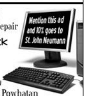
Mention this ad and 10% goes to St. John Neumann