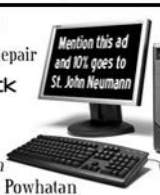
Mention this ad and 10% goes to St. John Neumann